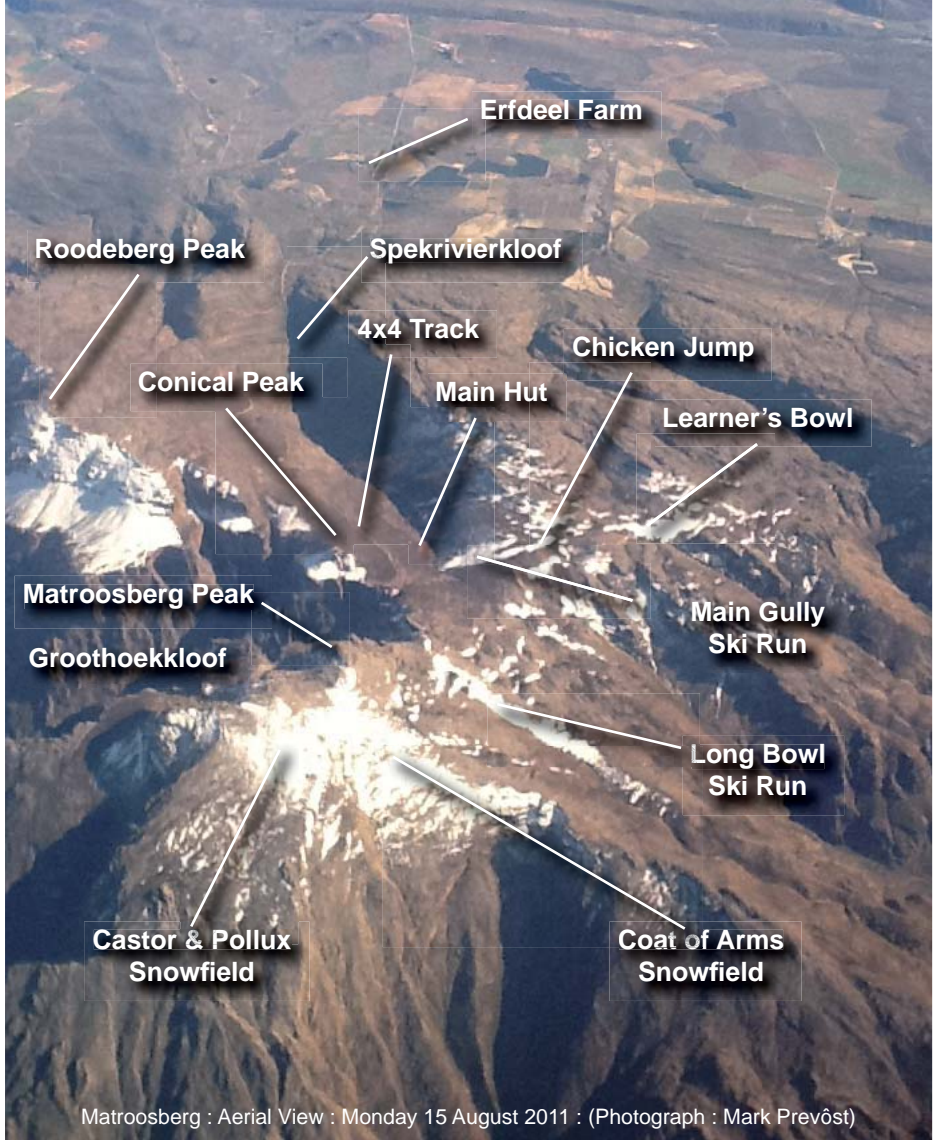
Matroosberg : Aerial View : Monday 15 August 2011 : (Photograph : Mark Prevost)

Some interesting GPS waypoints : Erfdeel Farm (Office) 33°19'47.62"/ 19°36'38.77" (1,161m); Ski Club Car Park 33°21'40.27"/ 19°38'17.69" (1,384m); Main Hut 33°22'14.34"/ 19°39'41.13" (1,794m); Top of Main Gully Ski Lift 33°22'04.25"/19°40'07.23" (1,980m); Long Bowl Ski Lift Hut 33°22'42.44"/19°40'21.23" (2,132m); Matroosberg Peak 33°22'59.85"/19°40'13.23" (2,249m).