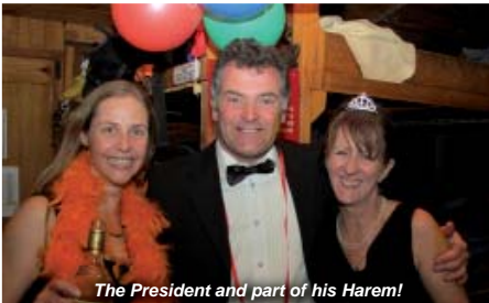
The President and part of his Harem!