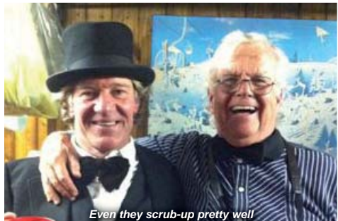
Even they scrub-up pretty well

The annual Ski Club of SA 'Cherry Picking Weekend' ('Klondyke' Cherry Farm) is a lot of fun. The Ski Club of Ski Base Hut has been booked for the whole weekend. Braai and Party on Saturday night ... !!!