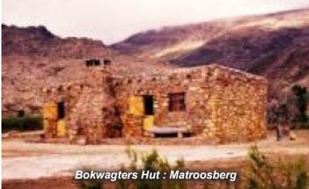
Bokwagters Hut : Matroosberg